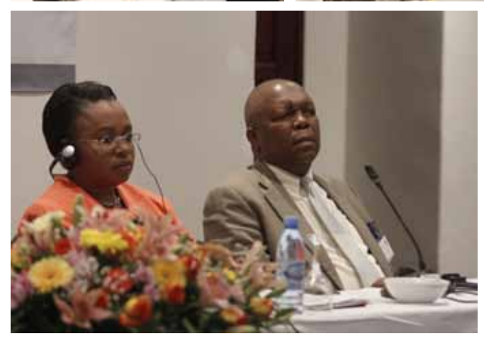
by all stakeholders involved in the processes of SADC economic and political integration.