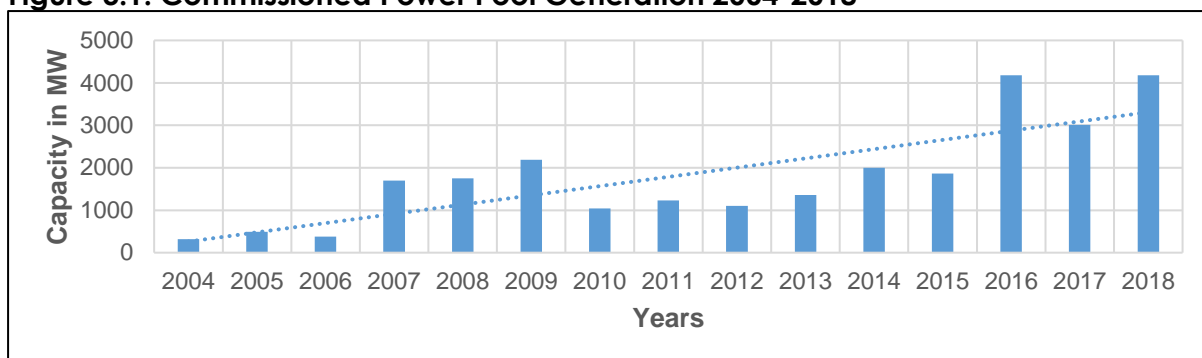
Figure 3.1: Commissioned Power Pool Generation 2004-2018

In line with the regional integration thrust in the energy sector, several transmission projects are planned to help distribute power from countries with surplus electricity production to those with shortfalls. The development of regional power interconnectors will enable SADC Member States to share and benefit from increased generation capacity across borders. The planned transmission projects are classified in three categories: