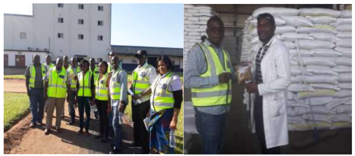
Visitation and collection of feed samples from one of the manufacturers.