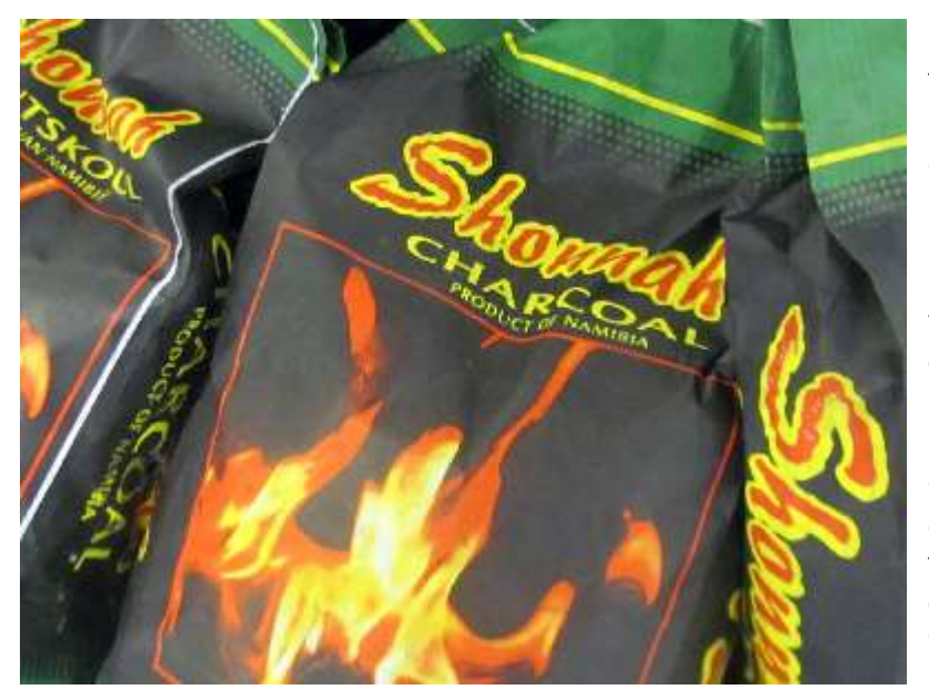
Figure 2 Six charcoal producing firms benefited from the grant. Savannah Makara currently supplies South African markets

The evaluation committee of the IUMP concluded the function to enhance productivity and competitiveness of selected firms, focusing on firm level diagnosis and implementation of supplyside interventions under the SADC Trade Related Facility (TRF) Project by evaluating 261 applications. evaluation and grant scheme fall under Intervention 8: Enhancing Industrial Development; Output 8.2: Interventions enhance productivity and competitiveness developed and implemented including participation in regional value chains under Activity 8.2.2, and Activity 8.2.3. the financial envelope for the grant. Upon analysis, firms were awarded amounts varying from N$150,000 US$10 714) to N$450,000 (US$32 143) out of a total budget allotment of N$7,720,550 US$551 468) or an estimated €408,000.