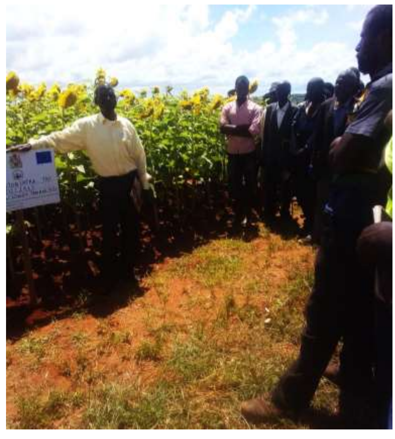
Fig.3: Profile of farmers and other stakeholders appreciating the influence of the TRF pack of technologies on growth, development and productivity of sunflower during the field day at Champhira in Mzimba on 18<sup>th</sup> April 2018.