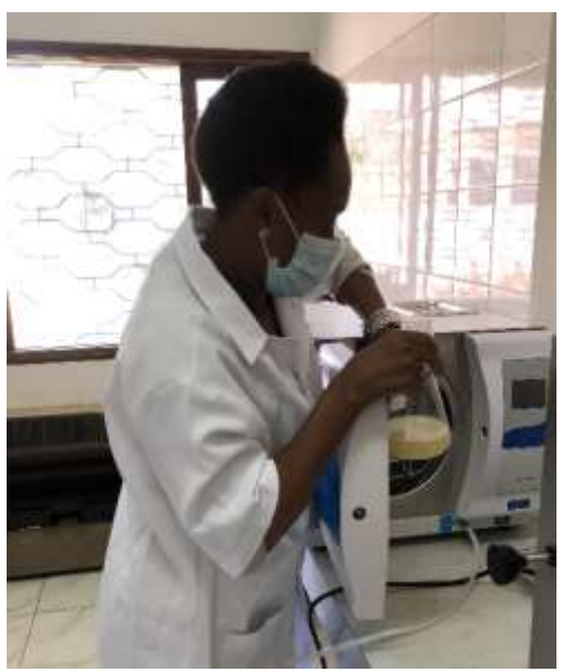
2. Autoclave ensures efficiency in the preparation of culture media.