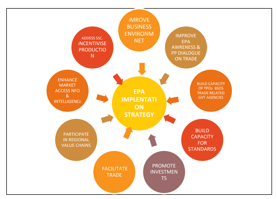
Fig.1: EPA environment