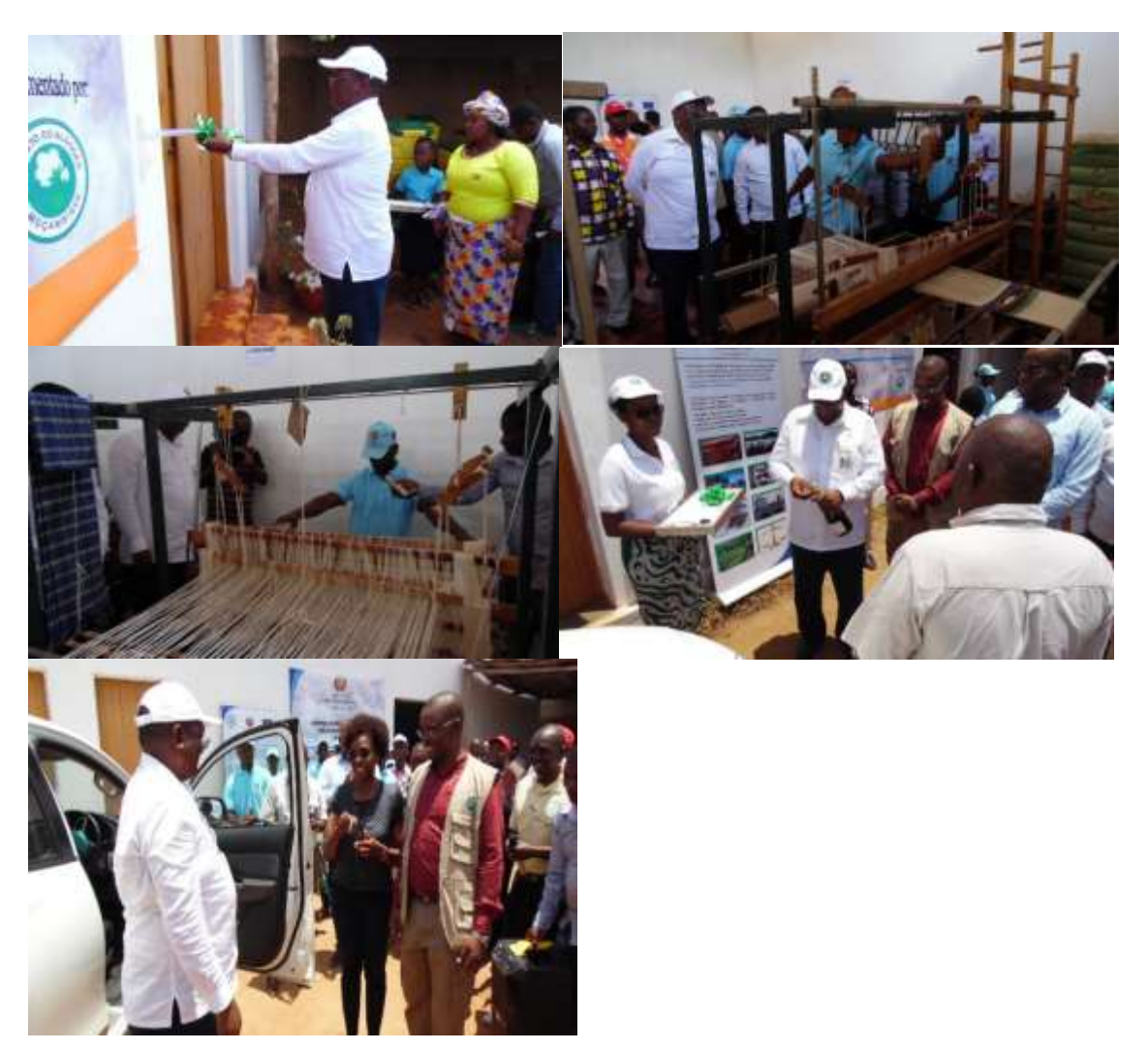
Fig. 2. Images of CEPAAN inauguration by the Minister of Agriculture and Rural Development.