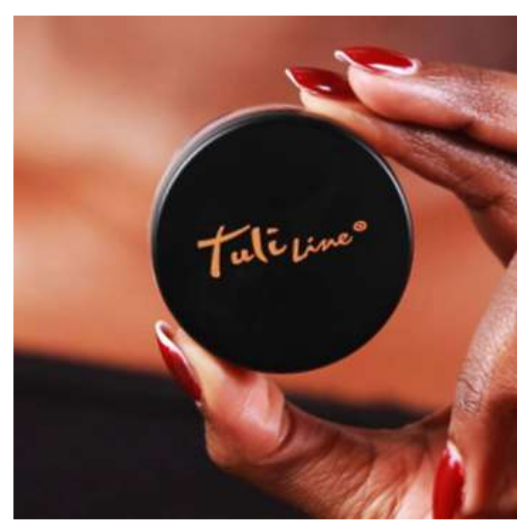
Figure 1 Tuli Line Products benefited under the Cosmetics and Pharmaceuticals sector following an impressive application submission

The evaluation committee of the IUMP concluded the function to enhance productivity and competitiveness of selected firms, focusing on firm level diagnosis and implementation of supplyside interventions under the SADC Trade Related Facility (TRF) Project by evaluating 261 applications. evaluation and grant scheme fall under Intervention 8: Enhancing Industrial Development; Output 8.2: Interventions enhance productivity and competitiveness developed and implemented including participation in regional value chains under Activity 8.2.2, and Activity 8.2.3. the financial envelope for the grant. Upon analysis, firms were awarded amounts varying from N$150,000 US$10 714) to N$450,000 (US$32 143) out of a total budget allotment of N$7,720,550 US$551 468) or an estimated €408,000.