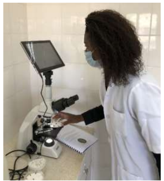
1. Binocular Optical Microscope allows for greater speed in the identification of phyto-pathogenic species.

One of the important achievements is, certainly, the increased laboratory capacity to contribute to pests and diseases introduction and dispersion prevention assured by a better laboratory diagnostic, with the acquisition of equipment and availability of reagents to face the present challenges.