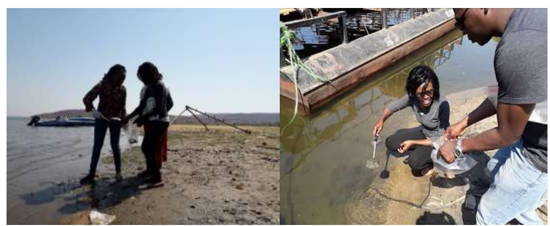
Collection of sediments from (a) non-boat landing areas and (b) boat landing areas by the research team

The significance of this project in the region is that Zambia is now producing products that comply with the international food standards and has already established key markets for these products and more so for organic honey which is already being exported to the EU and UK markets. Fresh water fish is gaining in demand in the region and the project is going to enhance Zambia's export competitiveness for fish and fish products in the near future as production levels increase. Fish was declared a major food product by the African Union and this boards well for Zambia to develop its aquaculture in order to meet future increases in demand for fish.