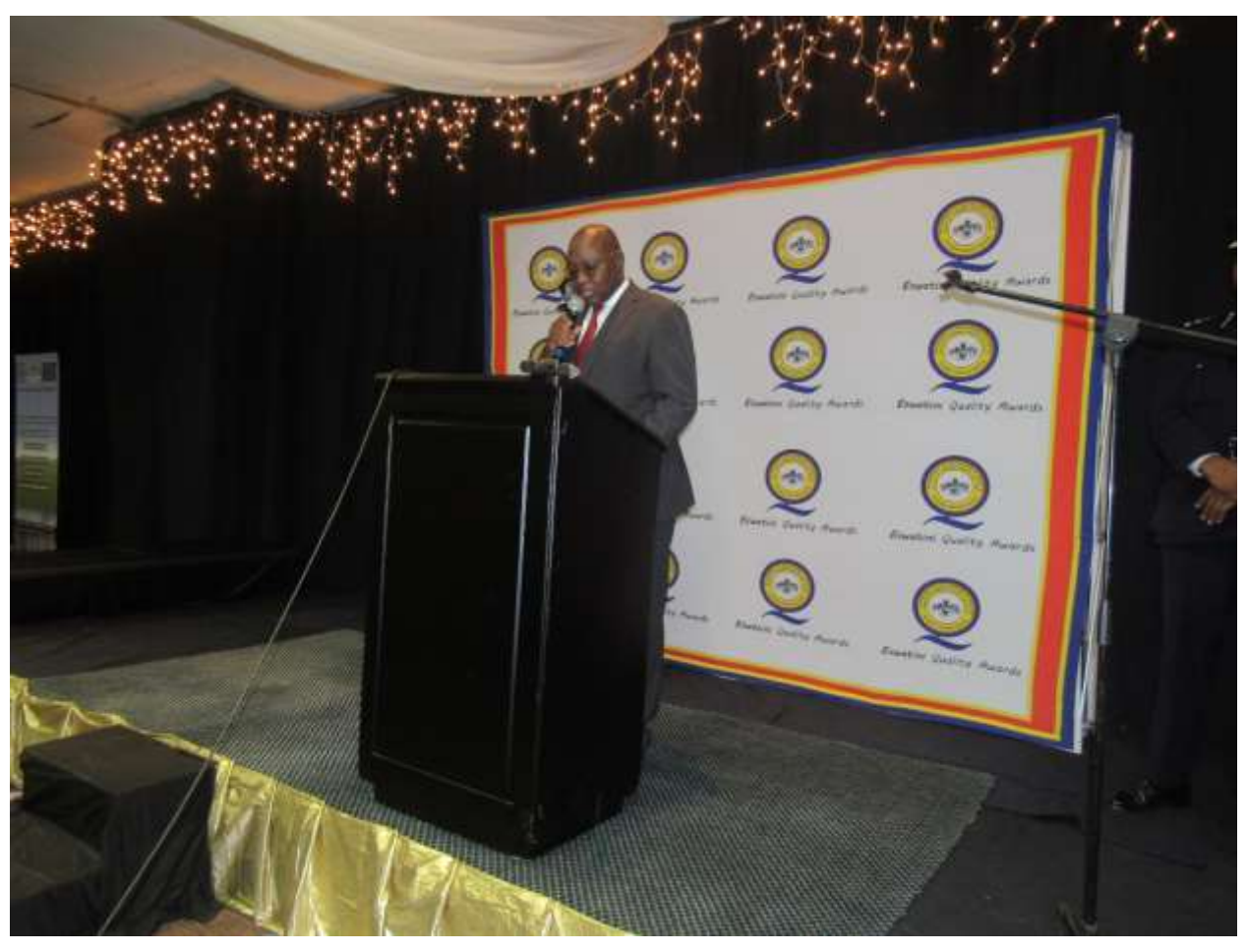
The Right Honourable Prime Minister Dlamini delivers his address during the launch of the National Quality Awards