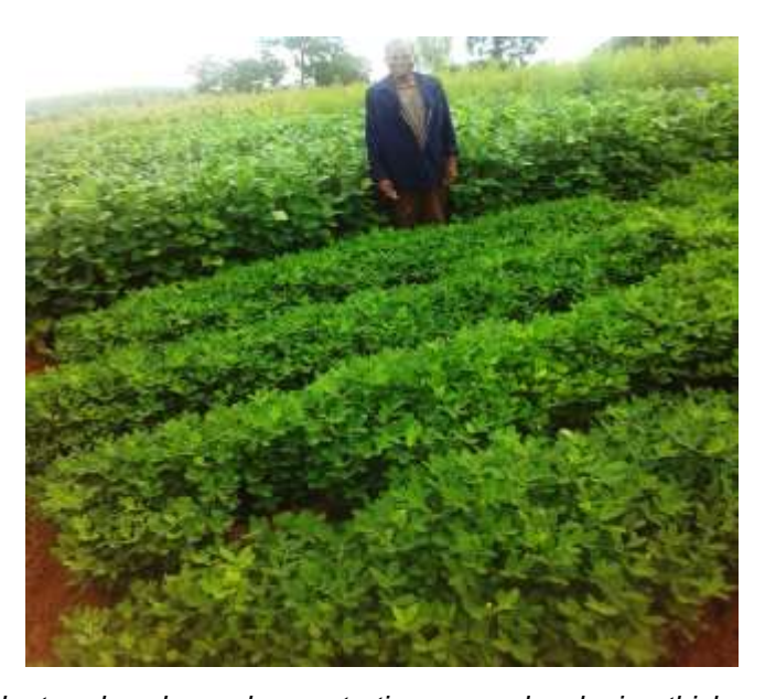
Fig.2: Thondwe groundnut and soybean demonstration crops developing thick canopies in total defiance of the drought spells as a response to the TRF pack of technologies; March 2018.

Oil seed sector continues to play a key role in Malawi's domestic economy. It has tremendous potential in enhancing regional and international trade as evidenced by continued demand in global markets. There is need to sustain benefits accrued from the TRF project through further adoption and use of the different technologies, agricultural extension service provision and intensification of industrial extension services to oilseed processors as Malawi continues to implement this project.