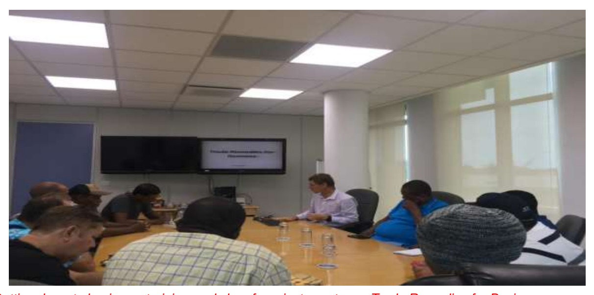
Getting down to business; training workshop for private sector on Trade Remedies for Business.

In June 2018, the Trade Department, in the Ministry of Finance, Trade, Investment and Economic Planning, with support of funding provided under the Trade Related Facility (TRF) a Southern African Development Community (SADC) programme financed by European Union, undertook a project to develop a national legal framework on trade remedies encompassing anti-dumping, safeguards and countervailing measures. The first phase involved numerous consultations, with all relevant stakeholders, such as the Fair Trading Commission and the Seychelles Chamber of Commerce and Industry, and after which a draft legislation on trade remedies was developed. A National validation workshop on the development of the legal framework for the trade remedies covering the three components of trade defense systems, was held at the Eden Bleu Hotel on 13th August 2018.