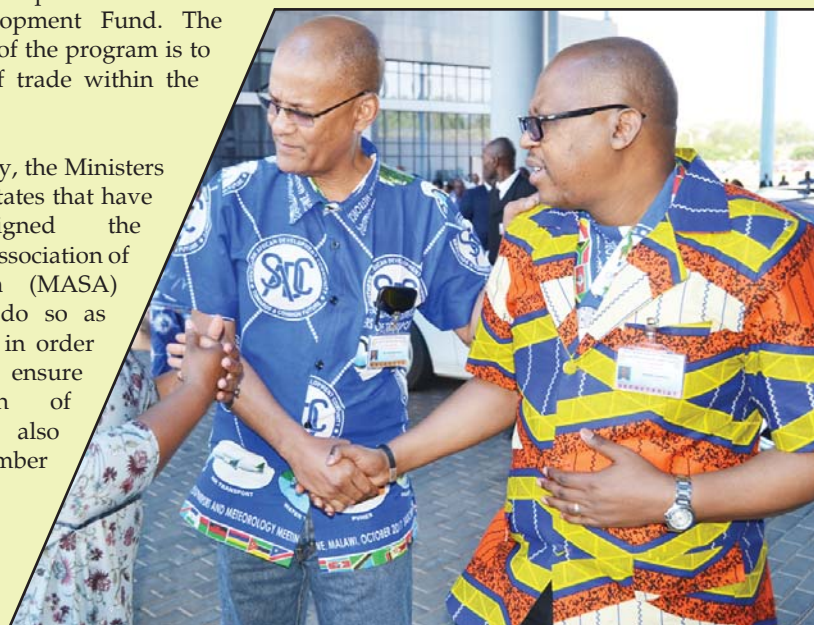
Delegates wearing the SADC branded attire during the meeting