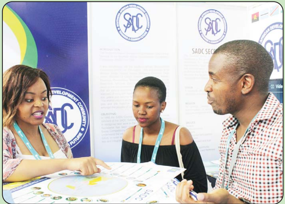
SADC staff (right) explaining services to visitors during the Global Expo

To SADC citizens, the event provided a unique opportunity for understanding how SADC Treaty, protocols, policies, decisions and programmes affect people's daily lives.