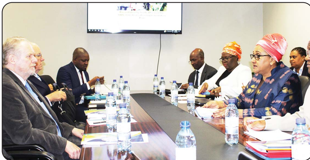
Meeting in session