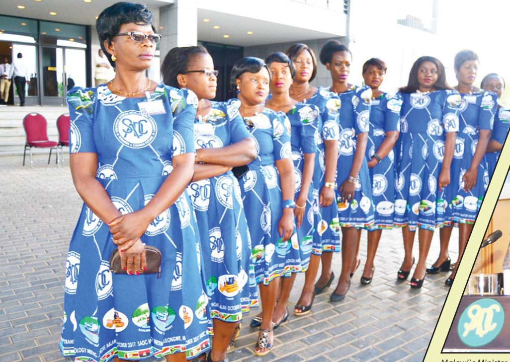
SADC branded attire at display during the SADC meeting at BICC