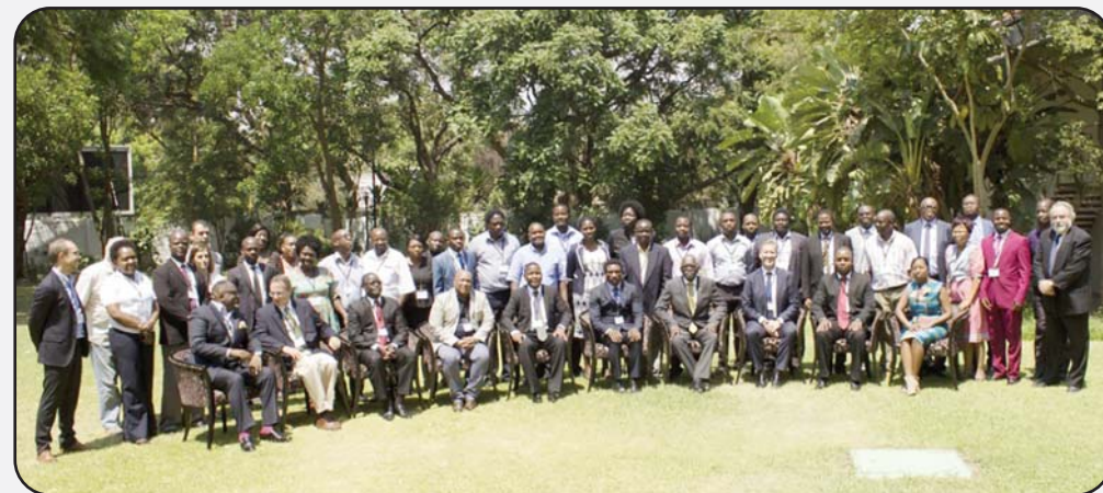
Participants at the SADC-WorldFish-FAO Platform for Genetic Improvement in Aquaculture, 25-29 September 2017, Lusaka, Zambia

SADC Member States have now realised that increasing Southern African aquaculture production is crucial for helping to feed the region's growing population, as well as generating income. With the right policies and strategies, there is enormous potential to develop fish farming in the SADC region, especially using tilapia – Africa's own indigenous fish which achieve good growth