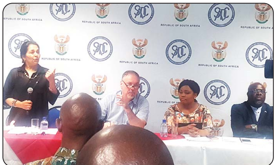
South Africa's Government Communication and Information System (GCIS) officials briefing journalists on SADC Media Awards