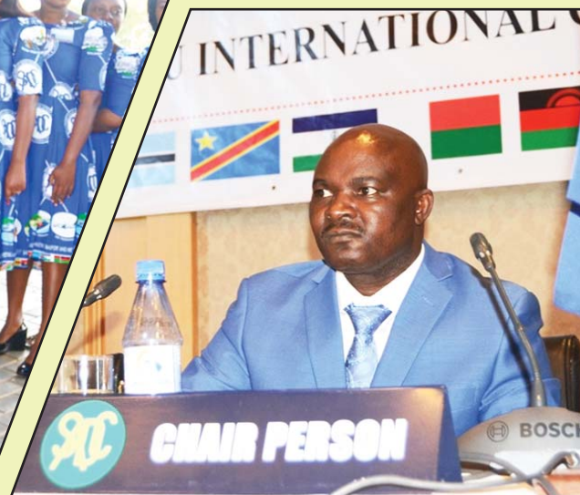
Malawi's Minister of Transport and Public Works, Honourable Jappie Mhangochi