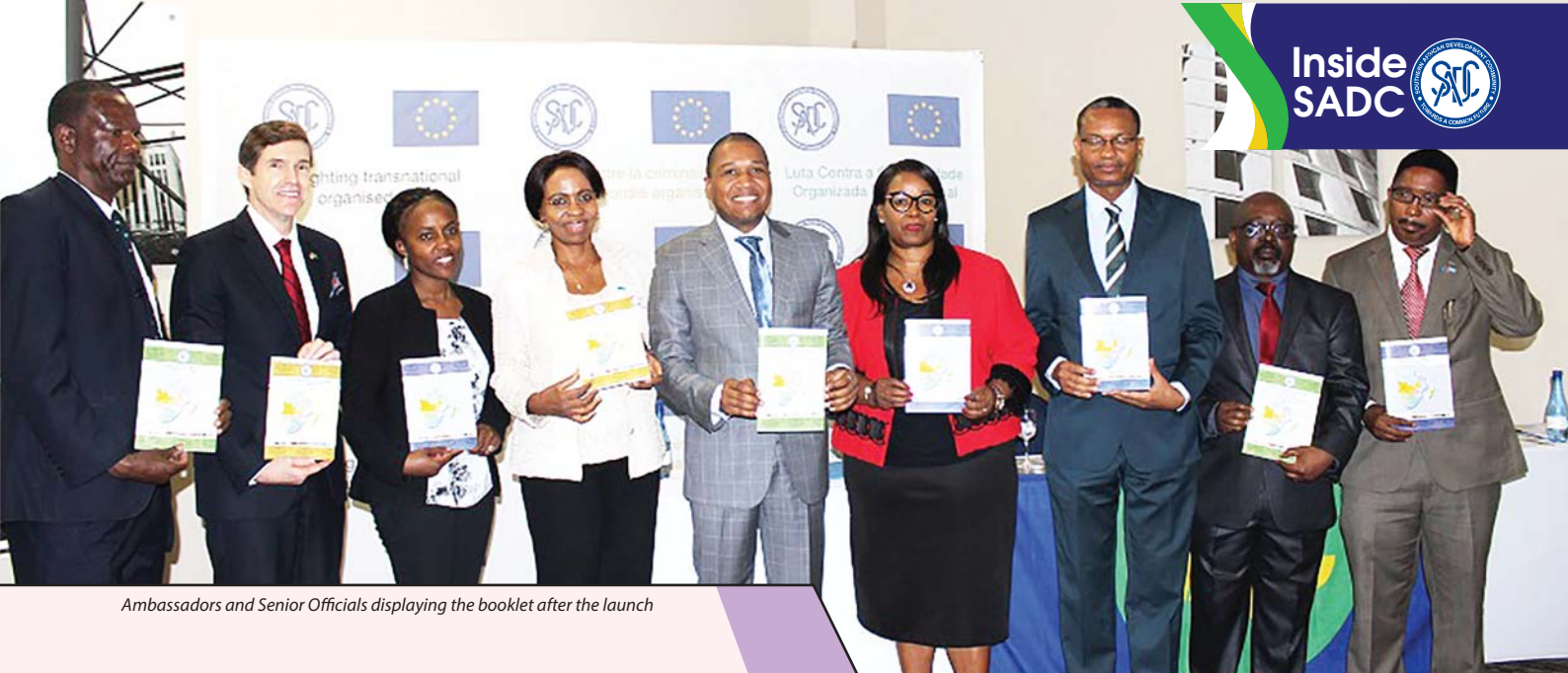
Ambassadors and Senior Officials displaying the booklet after the launch