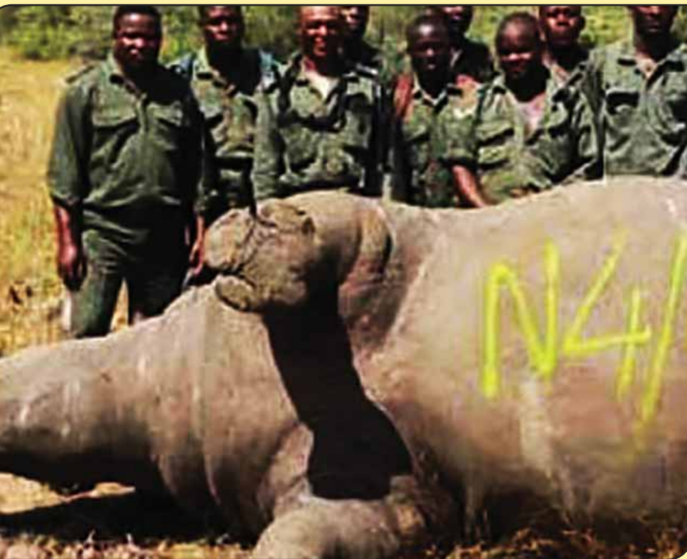
Due to persistent poaching, species like rhinoceros are becoming extinct

The SADC TFCA Network held its annual meeting from 16th to 18th October at the Southern African Wildlife College, within the Great Limpopo Transfrontier Park. The objectives of the meeting were to: