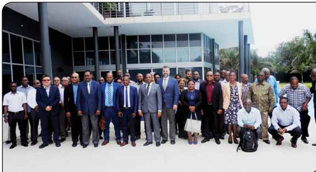
Group photo of delegates

the SADC Variety Release System, the SADC Seed Certification and Quality Assurance System, and the SADC Quarantine and Phytosanitary Measures for seed. The region is implementing HSRS to facilitate the movement of seed between Member States through trade. The system is meant to ensure smooth flow of seed of high quality at a less cost to the farmers.