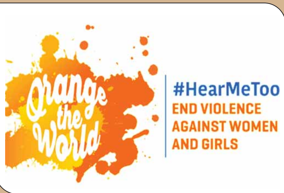
Poster of the 2018 Gender Based Violence theme