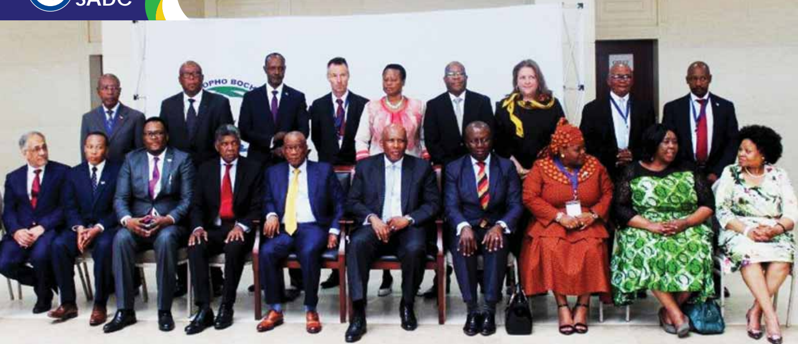
Dr Thabane (seated, fifth from left) with leaders of opposition parties and senior political figures in the Kingdom of Lesotho