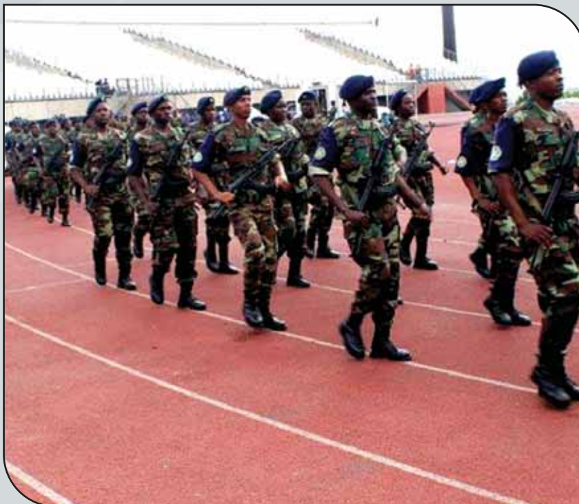
SADC forces during a drill at the closing ceremony for SAPMIL