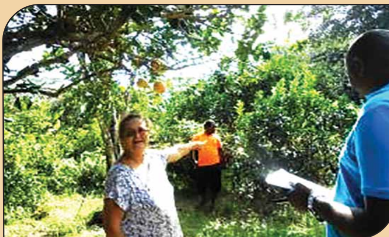
Assessment of farmer led on-farm conservation efforts in Praslin Islands

collection, seed viability testing (germination test procedures) and the characterisation of root and tuber crops.