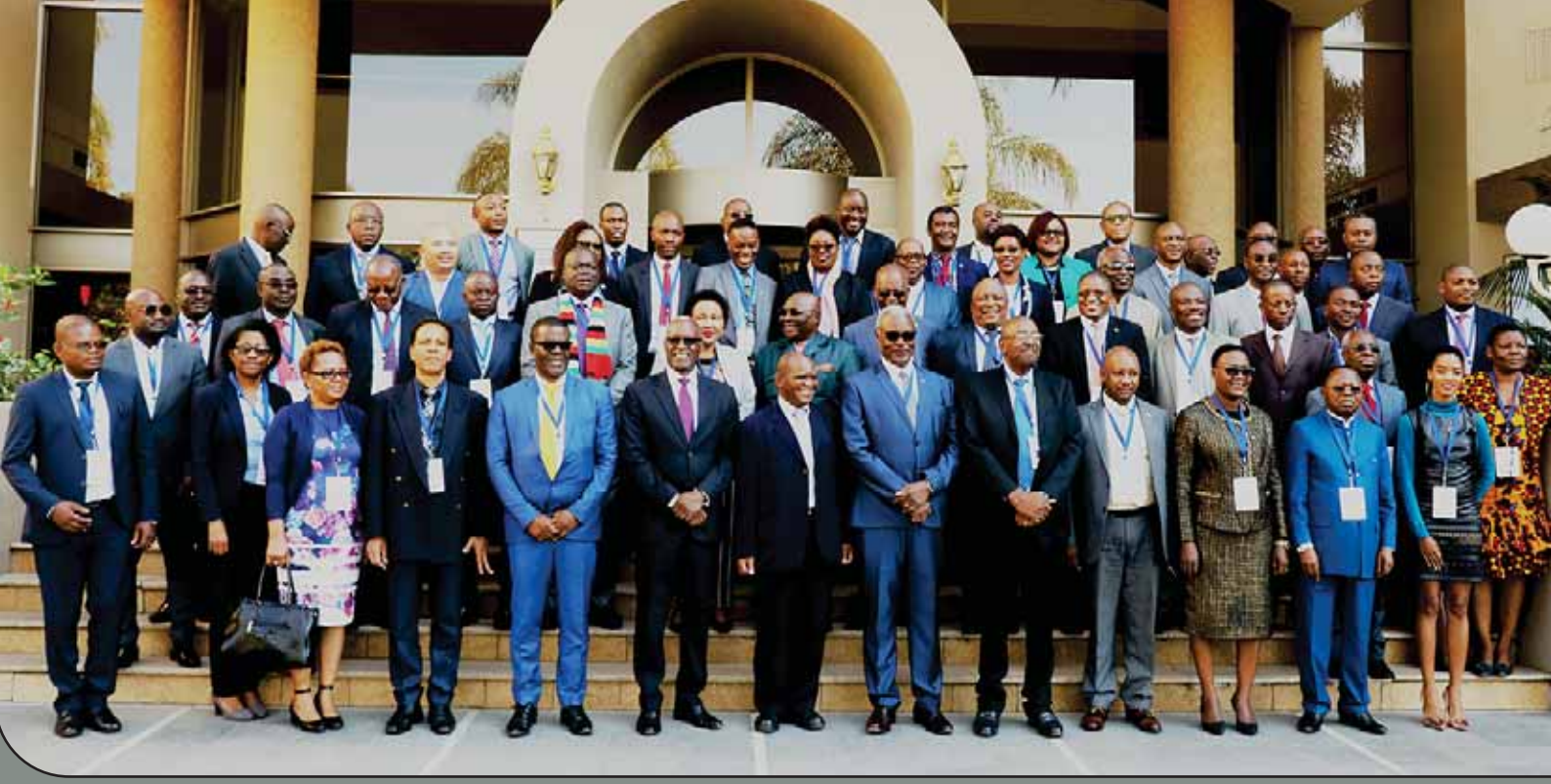
Group photo of the Ministers and delegates attending the meeting