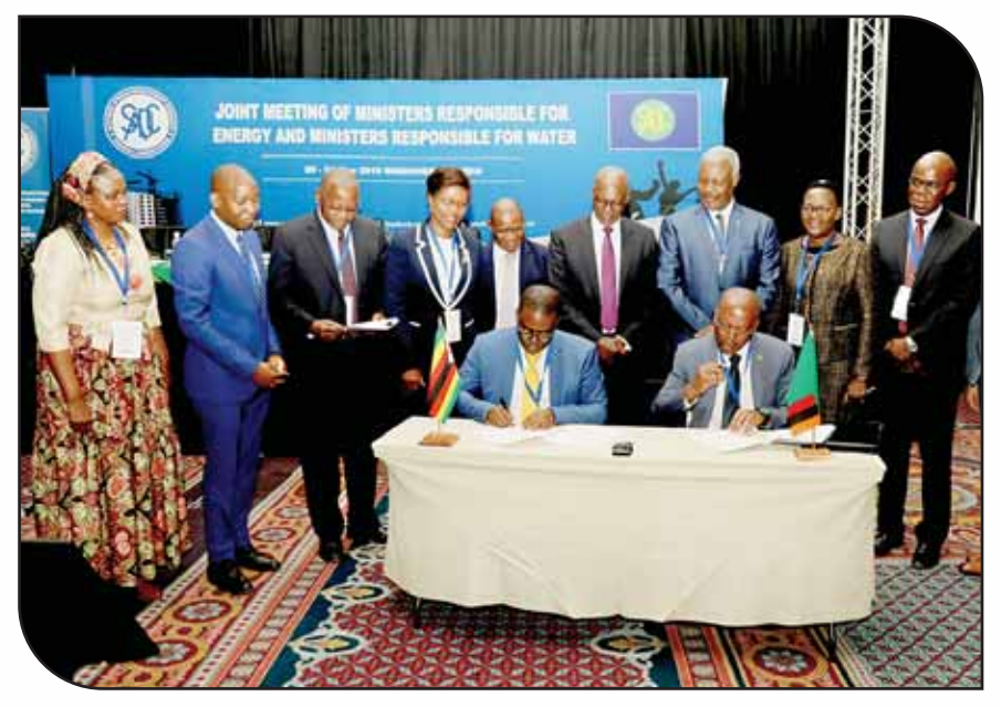
Ministers of the Republics of Zambia and Zimbabwe signing the SACREEE IGMoA

Memorandum of Agreement (IGMoA) which constitutes the formal founding act and status of the establishment of SACREEE by SADC Member States as a Centre of Excellence. The Ministers encouraged Member States who are still to sign the IGMoA to do so by the end of June 2019 in order to facilitate implementation of the SADC Renewable Energy and Energy Efficiency Strategy and Action Plan (REEESAP).