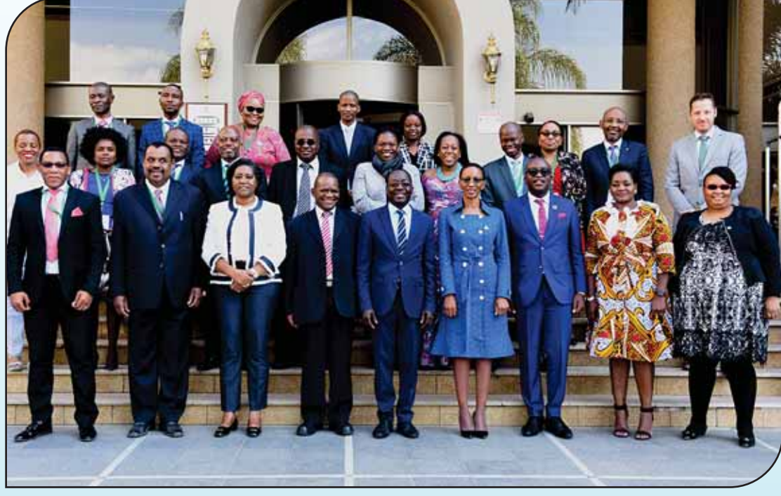
Group photo of Ministers

The meeting of SADC Ministers responsible for Youth deliberated on youth issues aimed at improving the quality of life for young people as well as providing a conducive environment for youth empowerment. The meeting discussed also thematic areas related to regional policy development and strengthening of institutional arrangements for advancing youth matters.