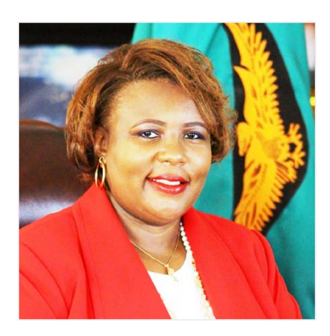
Hon. Dora Siliya, MP, Minister of Information and Broadcasting Services and Chief Government Spokesperson

Government is proud at the successful production of this special magazine on SADC Success Stories in Zambia. The publication is the first edition and is envisaged to be a regular publication in Government's quest to make SADC more visible. The publication highlights the importance of SADC, its protocols, programmes and projects as well as their impact on the people.