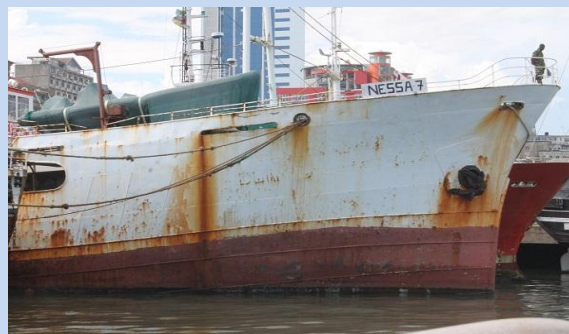
An IUU fishing vessel F/V NESSA 7 caught in Mozambican waters through collaboration & information exchange between Mozambican & South African authorities & Fish-I Africa project

SADC Member States share information leading to arrest of an IUU fishing vessel