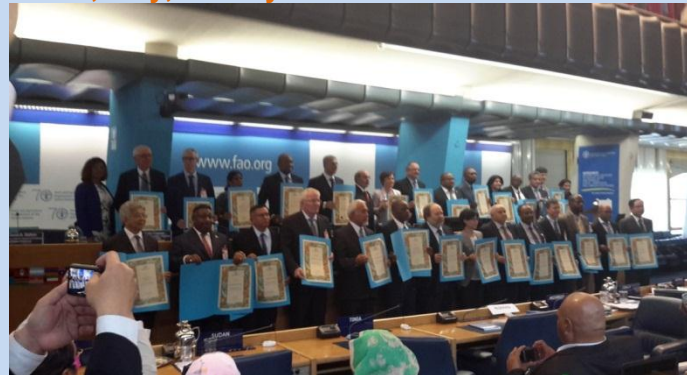
4 (Mauritius, Mozambique, Seychelles & South Africa) SADC Member States ratified the PSMA

SADC Member States receive Certificates of Recognition for their Commitment to the Long-term conservation and sustainable use of marine living resources and marine ecosystems at the 32 nd Session of Committee on Fisheries (COFI), Rome, Italy, 11 July 2016