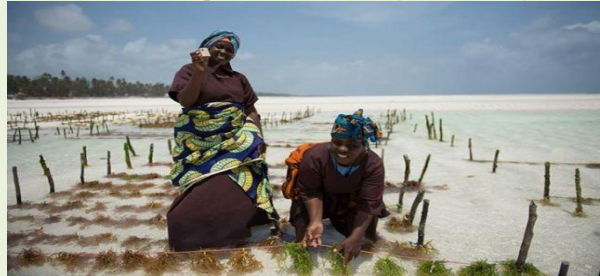
Seaweed farming in Tanzania (Zanzibar)