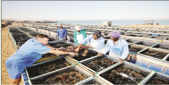
Abalone farming in South Africa