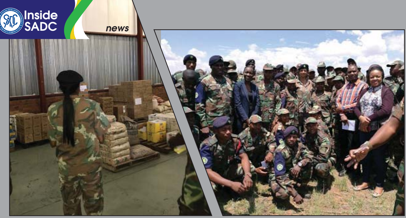
Stock taking of the supplies for the mission