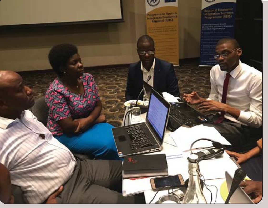
Participants during a group discussion session