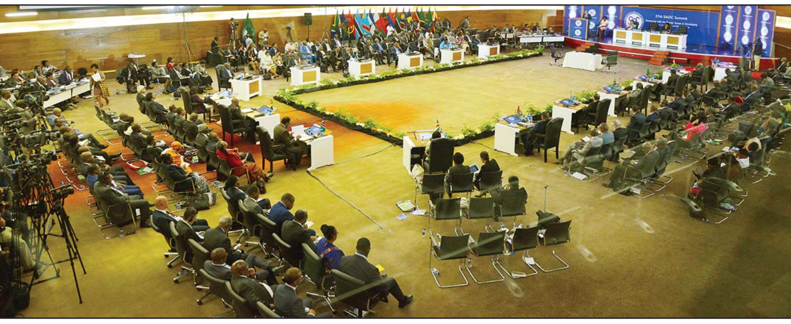
SADC Summit in session in August 2017 in Pretoria, South Africa

Strategic interventions proposed under the action plan include an improved policy environment for industrial development, increased volume and efficiency of public and private sector investments in the SADC economy, creation of regional value chains and participation in related global processes, as well as increased value addition for agricultural and non-agricultural products and services. To encourage the