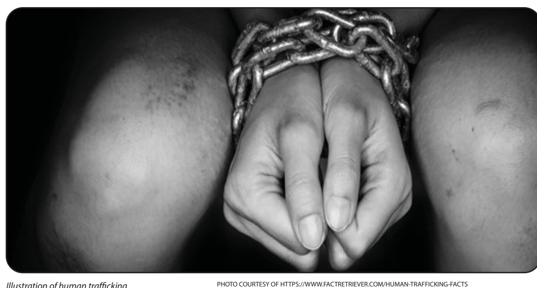
Illustration of human trafficking

draft Bill prior to its tabling in Cabinet.