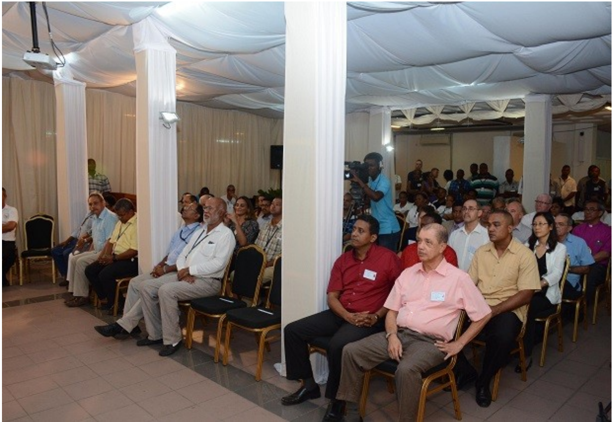
A view of some of the candidates and other guests present at the Electoral Commission's Headquarters as the results were being announced.