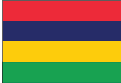
Republic of Mauritius