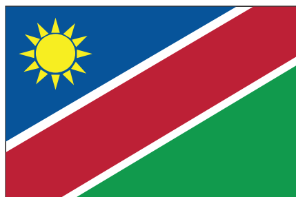
Republic of Namibia