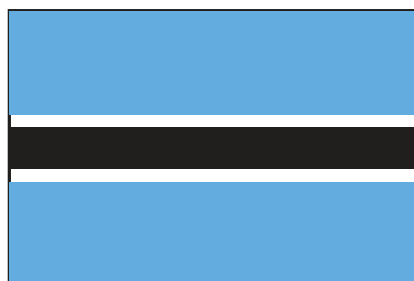
Republic of Botswana