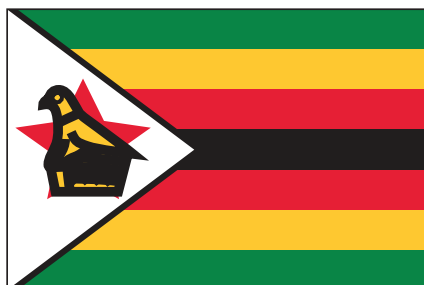
Republic of Zimbabwe